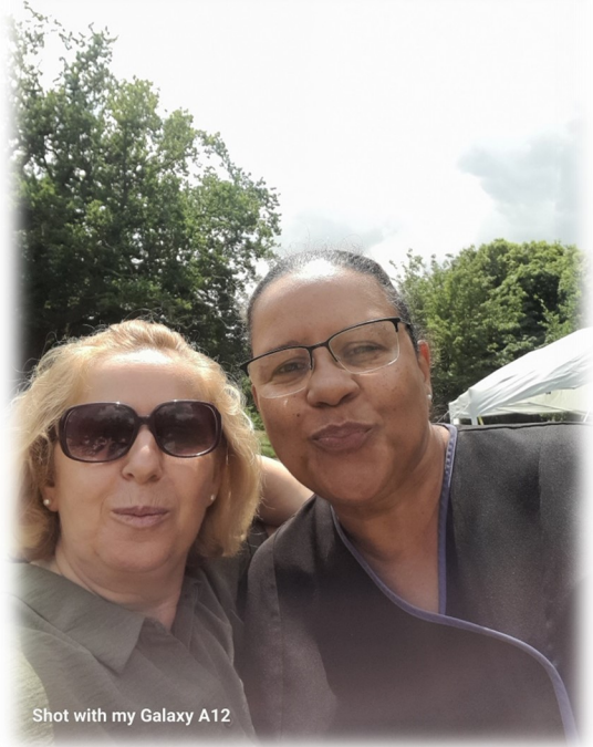
Shot with my Galaxy A12